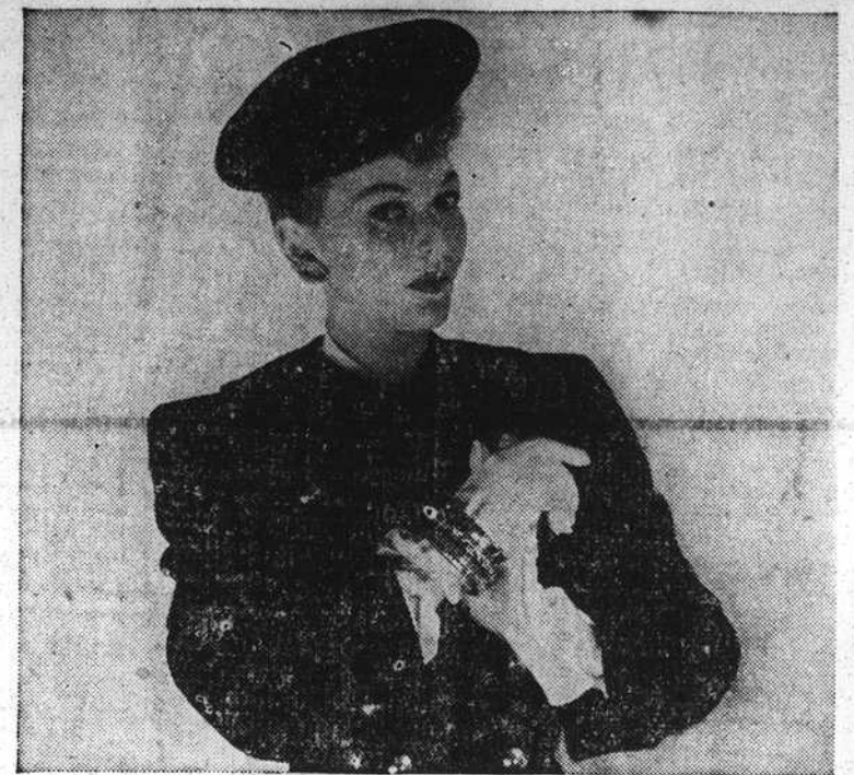
Fashion has gone military. Mary Martin, star of Broadway and the movies, is shown wearing a brass-buttoned, fitted topcoat of navy blue wool. The new model in the January issue of Harper's Bazaar has a deep rounded collar and turned-back cuffs. A beret of the same material completes her ensemble.