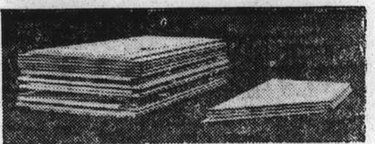
THE HOUSE IN PACKAGE FORM

The paper house is small and attractive—16 feet long, eight feet wide and eight feet high. Its roof is pentagon-shaped. Furnishings also include some paper such as the rug, cups and plates. Heat comes from a small coal stove.