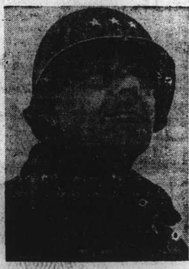
Lt. Gen. Jacob L. Devers, commanding general of the U. S. Sixth army group, made up of the 7th and 9th armies, both giving excellent accounts of themselves on the German front.