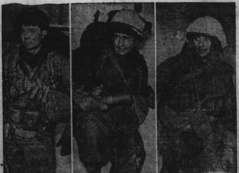
After a week in the front line, every minute of which might have been their last, these three doughboys are leaving the German front for a 48-hour break. Their faces plainly show the effects of the strain.