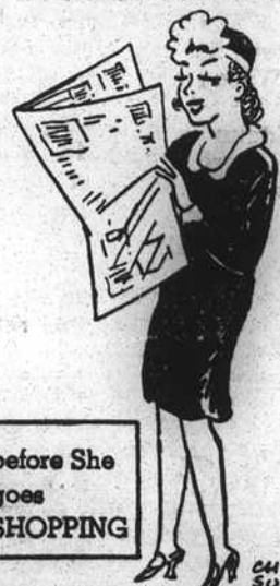
before She goes SHOPPING