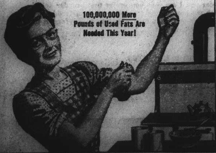
100,000,000 More Pounds of Used Fats Are Needed This Year!

HOW TO DO IT: Scrape broiler and roasting pans, skim soups and gravies. Melt down meat trimmings and table scraps. Add the liquid fat to your salvage can. Take the can to your butcher when full. He will give you two red points and up to four cents for every pound. If you have any difficulty, call your County Agent. This message has been approved by WFA and OPA and paid for by Industry.