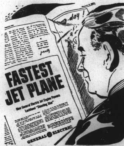
JET PROPULSION. General Electric developed the world's most powerful engine for the world's fastest plane—the G-E jet propulsion engine for the Lockheed P-80 "Shooting Star." It is over twice as powerful as previous models produced for the Army Air Forces.