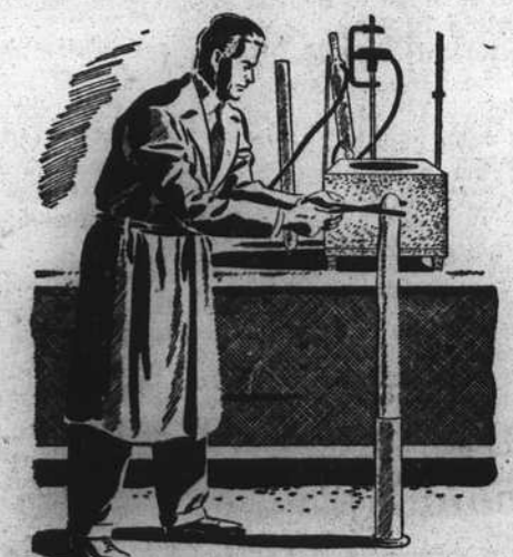
NEW DEVELOPMENTS. G-E research and engineering played a part in such recent developments as radar, silicones, jet propulsion, rocket weapons, remote gun control for the B-29 "Superfortress," the A-26 "Invader," and the P-61 "Black Widow."