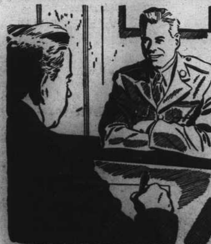
4735 WAR VETERANS HIRED. By the year's end 4735 returned service men and women were working at plants of General Electric and affiliated companies. 2986 were former G-E employees. On December 31, 1944, a total of 50,226 employees of General Electric and affiliates had entered the armed services.