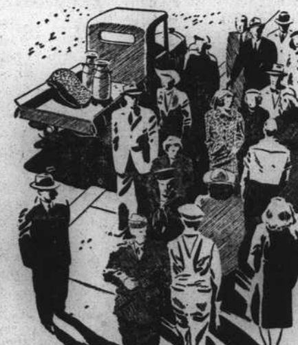
234,732 STOCKHOLDERS. Ownership of the company was divided among more stockholders than ever before. Dividends were $1.40 per share—same as 1943 and 1942, less than 1941 and 1940. Net income was less than 1940, while sales billed were 3½ times greater.