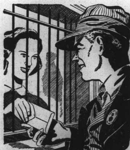
EMPLOYEE EARNINGS UP. The average G-E employee earned $2,772 in 1944. Employees also shared $234,000 in Suggestion Awards. Top award was $2,000 for an idea that speeded production of G-E gun control for the B-29. G-E employee suggestions aid the war effort.