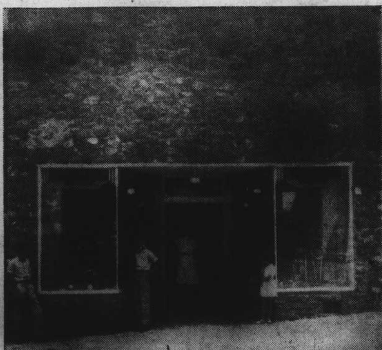
Shown above is a front view of the new Firestone Store which opened here recently under the ownership of Claude Miles, Wayne Waddell and Alton Thompson. The store is located on Main Street next to the Alleghany Motor Co. garage building.