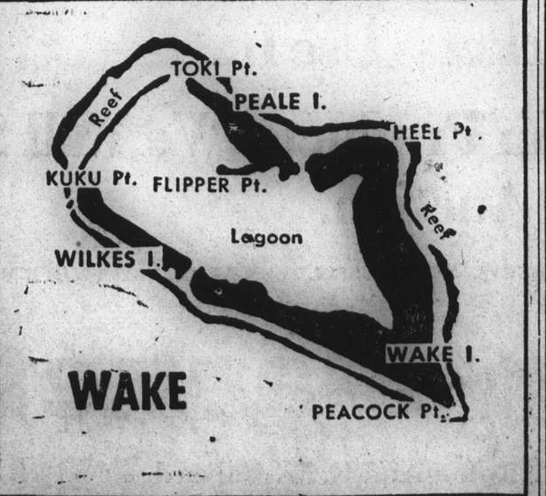
When the Allies by-passed Wake Island, they had no intention of leaving this group of islands in the hands of the Japanese. Recent reports indicate that Allied activity is again headed toward Wake and adjoining islands as shown on map above.