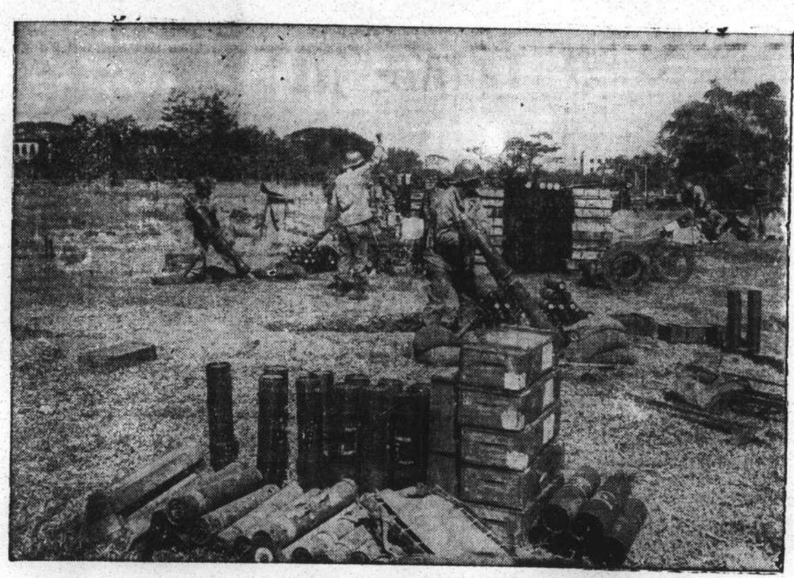
An 82nd CWA mortar crew cleaning out a nest of Japanese on Luzon Island.