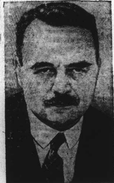
Shown above is Fred Burrows, 56, former $10 a week railway porter, who has been appointed governor of Bengal, India. He will govern 60 million inhabitants and pilot them through a five-year-plan to modernize the province's land tenure system.

Is Partially Covered By Insurance; Will Build New Church