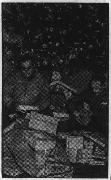
Address mail properly to reach all servicemen everywhere.

Whether the card is sent to a person in service or to someone in the immediate circle of friends and relatives, it is always wise to be