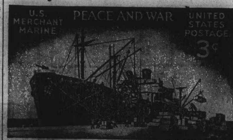
Shown above, a replica of a postage stamp honoring the United States merchant marine which will soon be placed on sale. It will be of three cent denomination, printed in blue, of special delivery size.