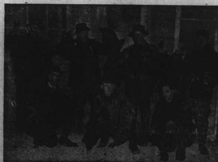
A few of the 1,000 crows killed in the greatest bird hunt in Pennsylvania's history at the Edenburg rookery, Lawrence county, recently by more than 1,000 western Pennsylvania hunters. The saving to farmers will run into thousands of dollars.