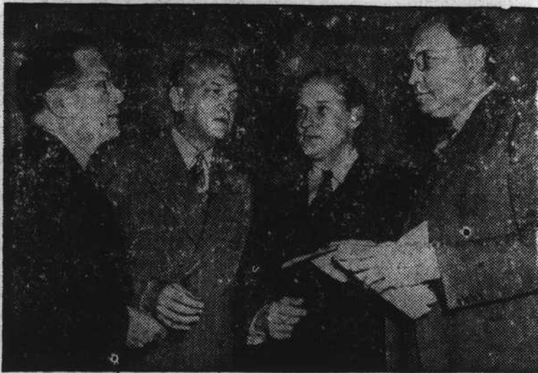
Senators Allen J. Ellender (Dem., La.), Scott W. Lucas (Dem., Ill.), William F. Knowland (Rep., Calif.), and James O. Eastland (Dem., Miss.) hold a council of war in Washington to see what they can do to halt strikes that interfere with the wheels of industry.