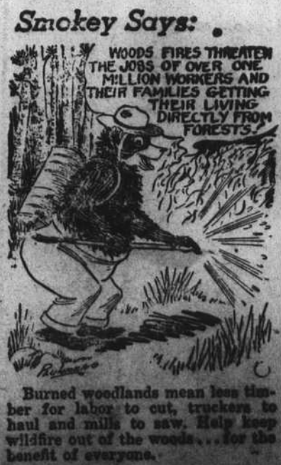
Burned woodlands mean less timber for labor to cut, trucks to haul and mills to saw. Help keep wildfire out of the woods... for the benefit of everyone.