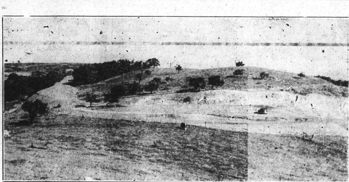
A section of the Blue Ridge Parkway from which thousands of tourists now view scenes of grandeur and beauty.