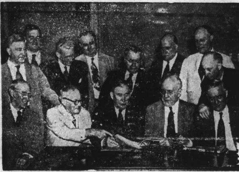
This house-senate committee made up of conferees from both houses of congress, decided the fate of OPA extension legislation.