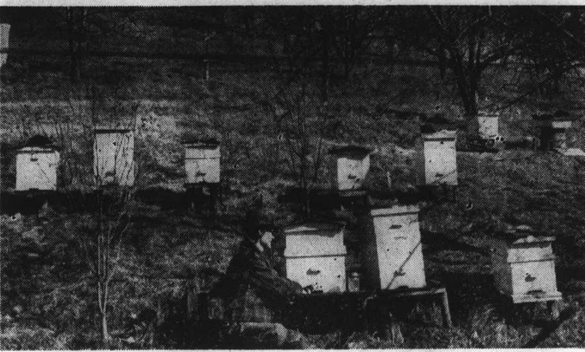
Sourwood and white clover honey is now being taken from these and other bee hives in Alleghany. And because of the sugar shortage, honey is being double enjoyed by many.