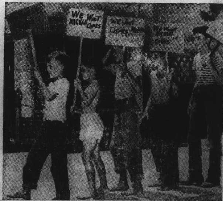
Asserting that their living standard is cut in half by discontinuance of the sale of nickel cones and drinks, a group of Burbank, Calif., boys picket a malt shop. The picket line was broken when the proprietor invited the boys in for "one on the house."