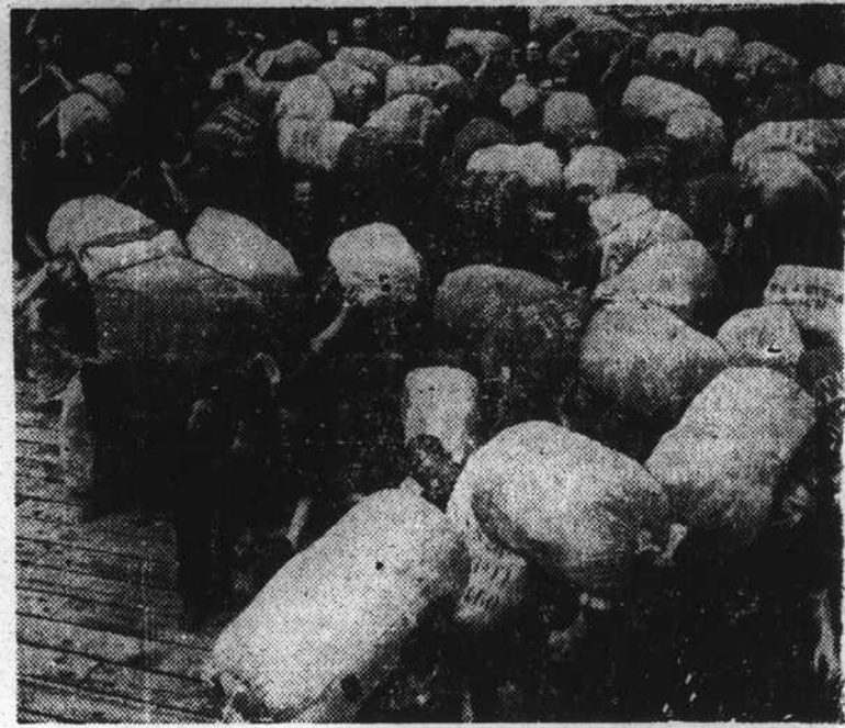
The last batch of German prisoners of war, with the exception of those still in hospitals or in prisons convicted of crimes, are shown as they sailed for their homeland from Piermont, N. Y.