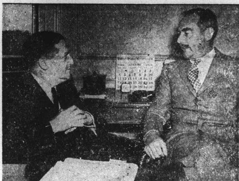
Herschel Johnson, left, U. S. deputy on the United Nations security council, shown conferring with acting secretary of state Dean Acheson, right, at the state department.