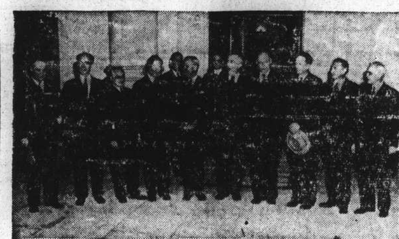
Members of the new U. S. supreme court as they called on President Truman, left to right: Associate justices, Wiley Rutledge, Frank Murphy, Felix Frankfurter, Hugo L. Black, President Truman, Chief Justice Vinson, and associate justices, Stanley F. Reed, William O. Douglas, Robert J. Jackson and Harold H. Burton.