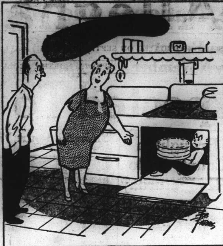
"He insists on guarding his birthday cake with his life."