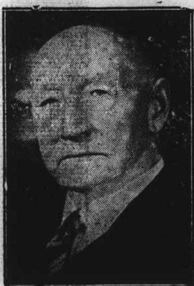
R. L. DOUGHTON, U. S. Congress