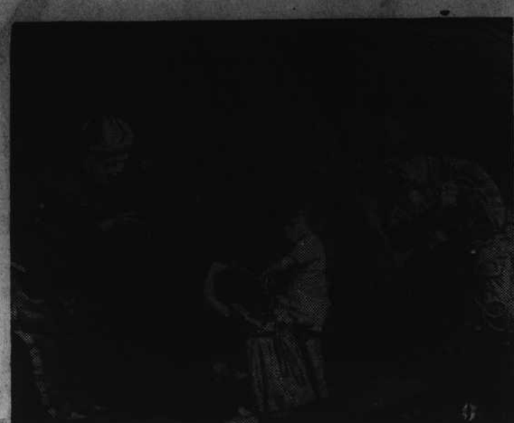
CIRCUS DAYS ARE COMING... Scenes like this will be duplicated all over the country as Little Mr. and Mrs. America try for a personal view of Ringling Bros. and Barnum & Bailey circus when the big show starts its country-wide 1947 tour.