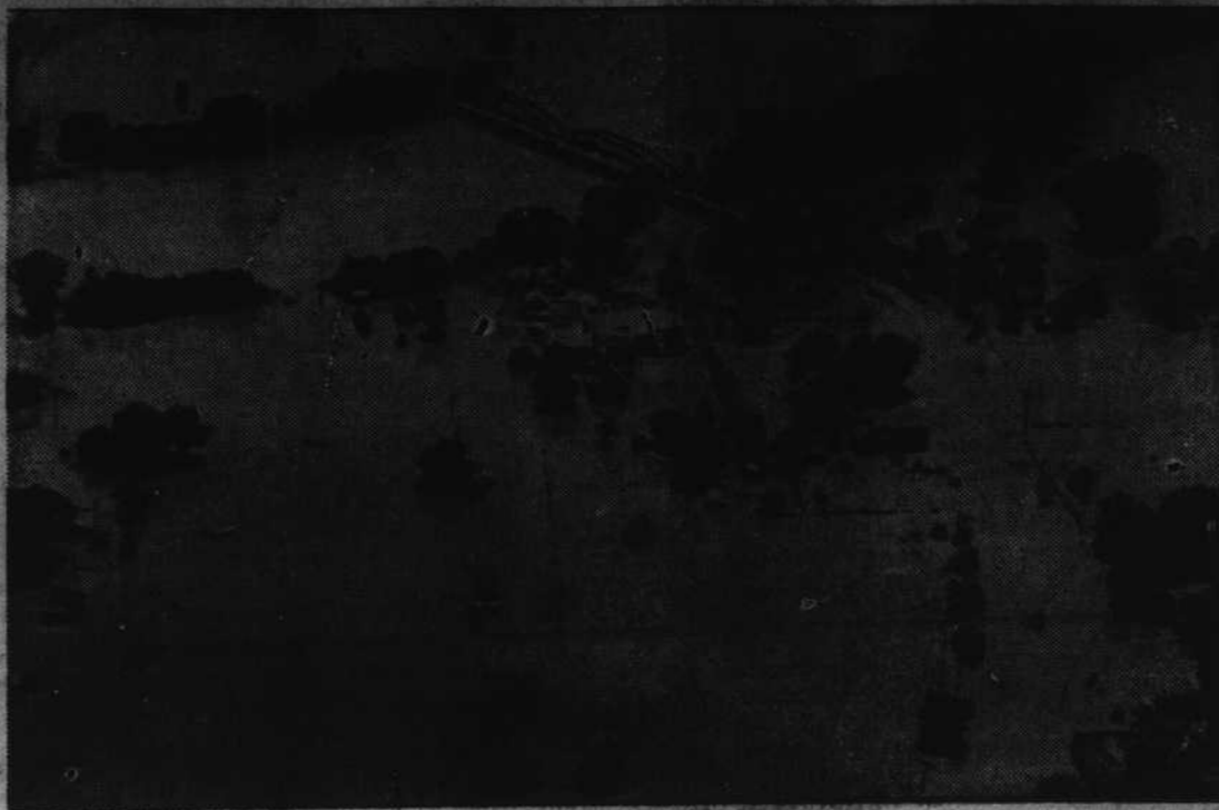
The town shown above, Red Rock, Ia., is in the Des Moines river valley, the center of Iowa's worst flood in history, in which many lost their lives and untold damage resulted to farm land and towns. The same story held in other states where high water flooded valuable farm land.