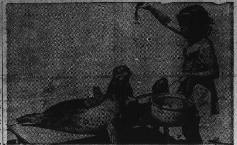
PETS FROM THE DEEP . . ! Little Shireen O'Brien feeds some home ess seals at Seaside, Ore. Baby seals, separated from their moms and sops, are picked up on the beach almost every year at this time. Processional hunters kill the seals for their skins, thus leaving the babies ted and the little ones are usually washed ashore.