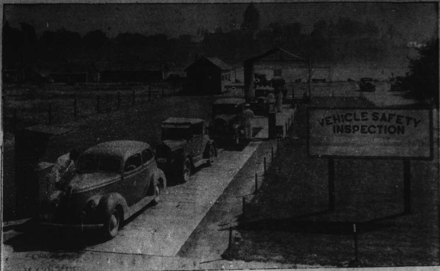
Early in January motorists will have an opportunity to drive in a vehicle safety inspection lane, like the one above, to have their cars checked under the regulation set up in highway safety measure passed by the last legislature.