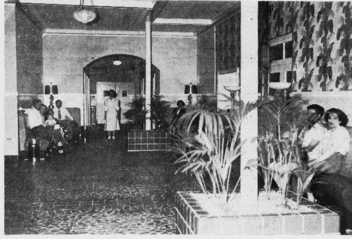
Shown above is the lobby in the new clinic of the Valdese General Hospital. To people who knew the old building, used until recently as a nurses' home, the transformation is as miraculous as the making of a silk purse from a sow's ear. Walls are a soft green, and the floors of red tile. The day of the antiseptically white hospital no longer prevails, and the hospital becomes a friendly personal place.