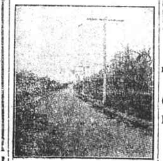
A GRAVEL ROAD.

BALTIMORE STEAM PACKET CO. STEAMERS OLD BAY LINE FLORIDA, VIRGINIA & ALABAMA