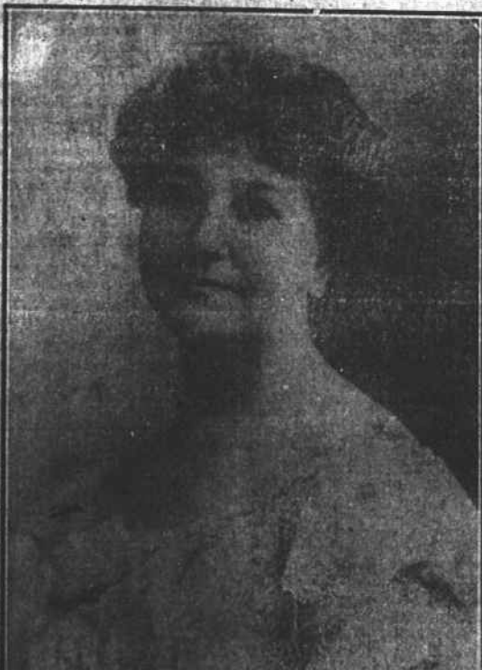
MRS. WOODROW WILSON.