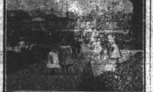
OUTDOOR PLAYGROUND WITH UNIT SYSTEM OF CLASSROOMS IN BACKGROUND. contests, and the amphitheater described will provide seating capacity.