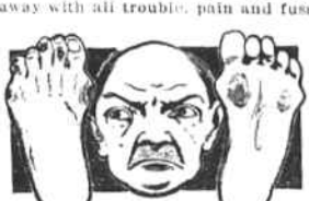
Get the Corns Off Your Feet, and the Corns Winkles Off Your Face. Nothing Can Do It Like "GETS-IT."

If you have corns now, the chances are you have never used "GETS-IT," the biggest seller among corn cures ever known. It is the new way, does away with all trouble, pain and fuss.