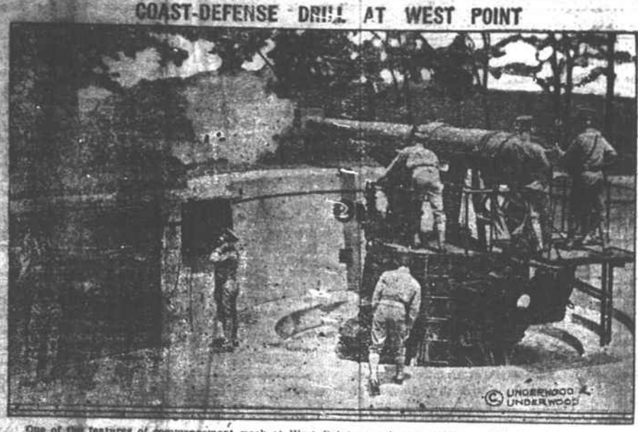
One of the features of commencement week at West Point was the coast-defense drill, in which men of the first and third-riseses participated. The photograph shows cadets firing one of the six-inch guns and, on the left two of the min receiving the angle of sight and range from the captain of the gun squad.

Avoid Worry. To Use above worry is no little task oppositely for pursons of a nerve of the will. The confessed to be in the less of the will be established through the ever conquering power of the will. TRY OUR CHERRY CREAM—IT IS DELICIOUS. Crystal Ice Company Trailest destroyers: It lines the face will forward that are difficult to resure and far from pleasing to look