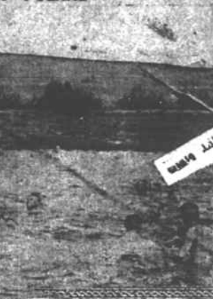
MANY OF CARRANZA'S TROOPS ARE REPORTED TO HAVE CROSSED THE RIO GRANDE TO STIR UP A GENERAL UPRISING.