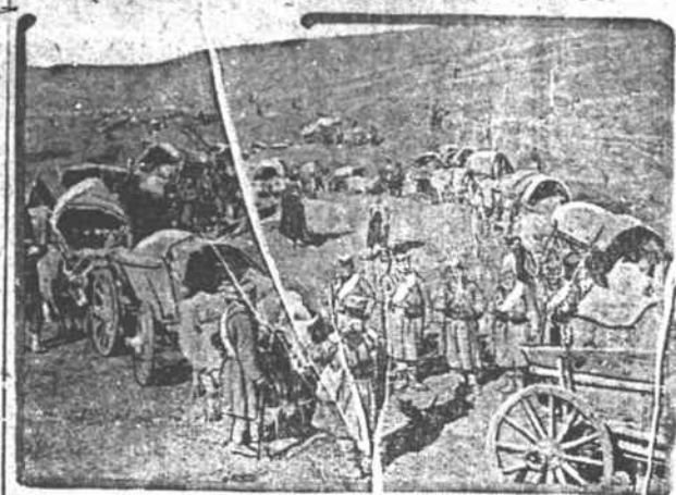
View of a Bulgarian transport train at d its convoy of infantrymen after the Bulgars had begun the invasion of Serl da.