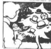
It Seemed to Grow All Kinds of Hats.

When Broken Glass Has Value. People in Tibet value highly the spectacles of smoked or colored glass that are sold to them by the Chinese, because of the blinding brightness of the sun on the snow.