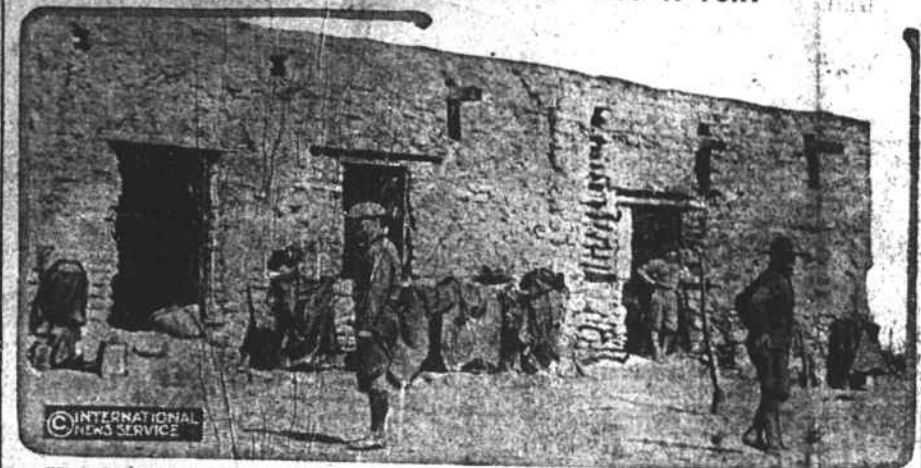
When the American troops encamped at Espis, Mexico, they took possession of this old adobe ranch to ched portholes in its walks and occupied it as a fort.