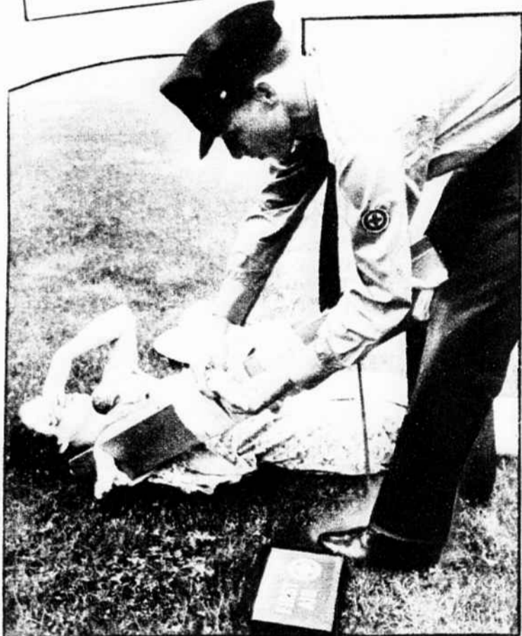
Police officer, one of 2,000,000 Red Cross first aiders, demonstrates aid to injured

These and many other Red Cross services for preservation of life and prevention of suffering are supported by men and women who join the 3,700 Red Cross Chapters and their 9,000 Branches throughout America. Your community helped in this work. Join your local Chapter during the Annual Roll Call, November 11-30. Do your part!