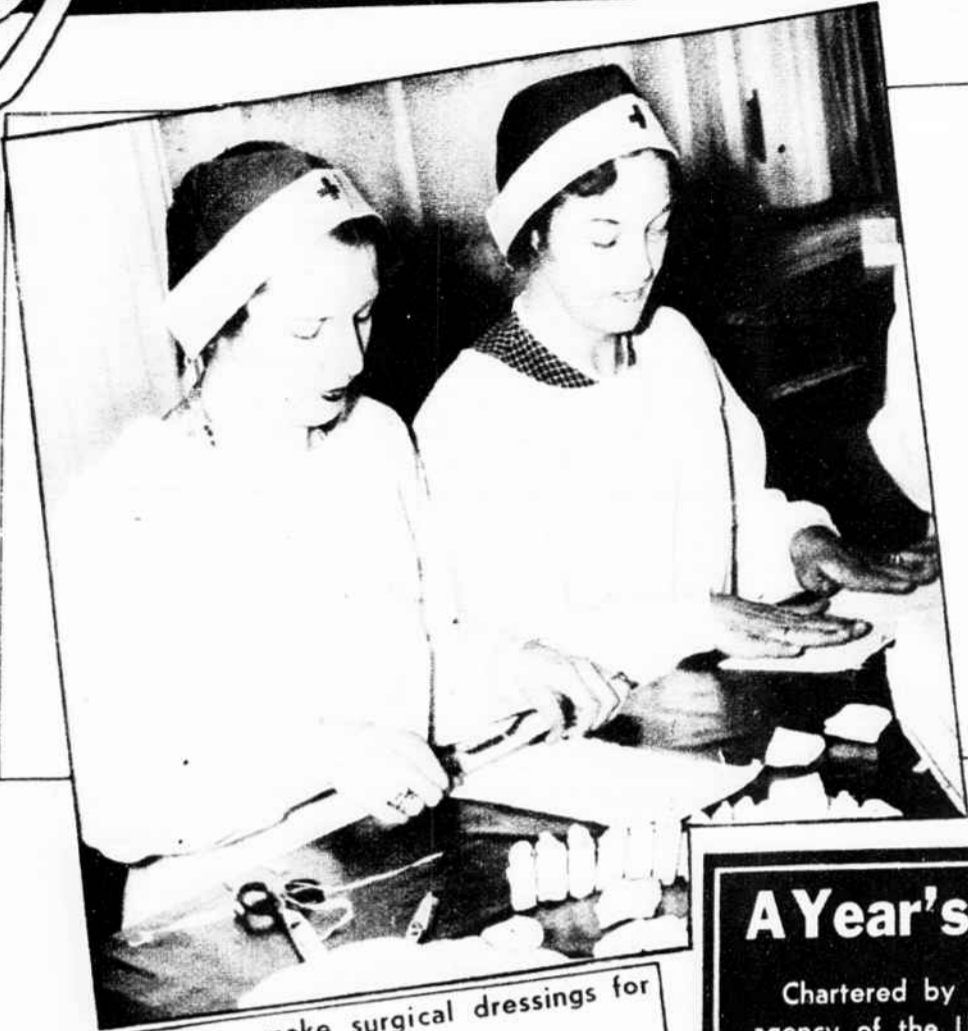
Women volunteers make surgical dressings for war wounded