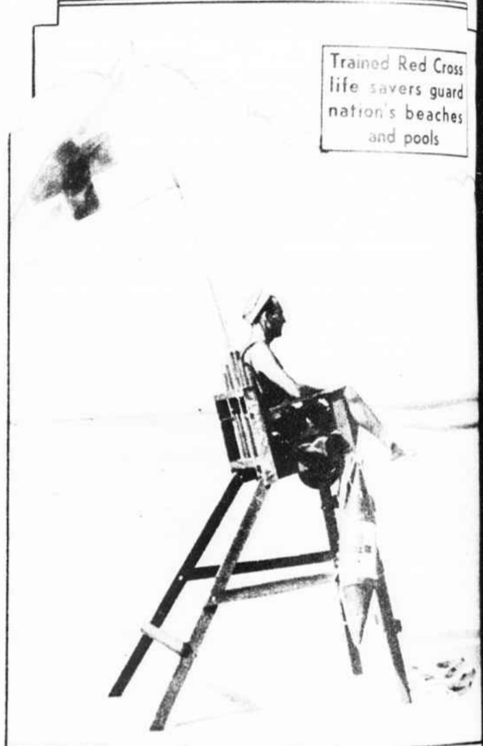
Trained Red Cross life savers guard nation's beaches and pools