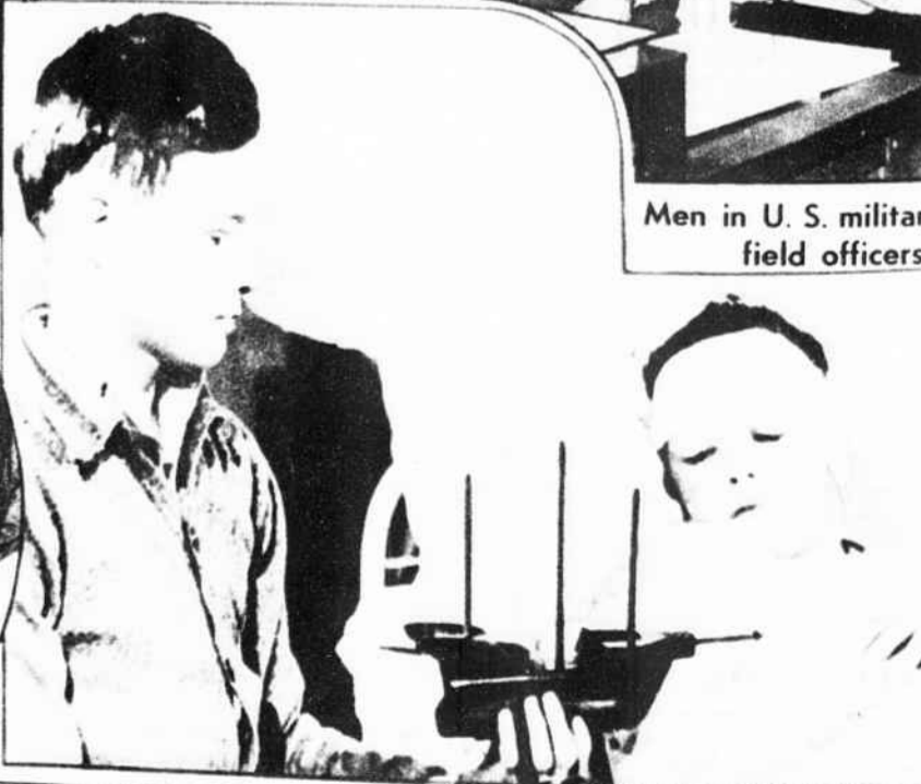
Junior Red Cross member gives toy to injured boy—"We Serve", their motto