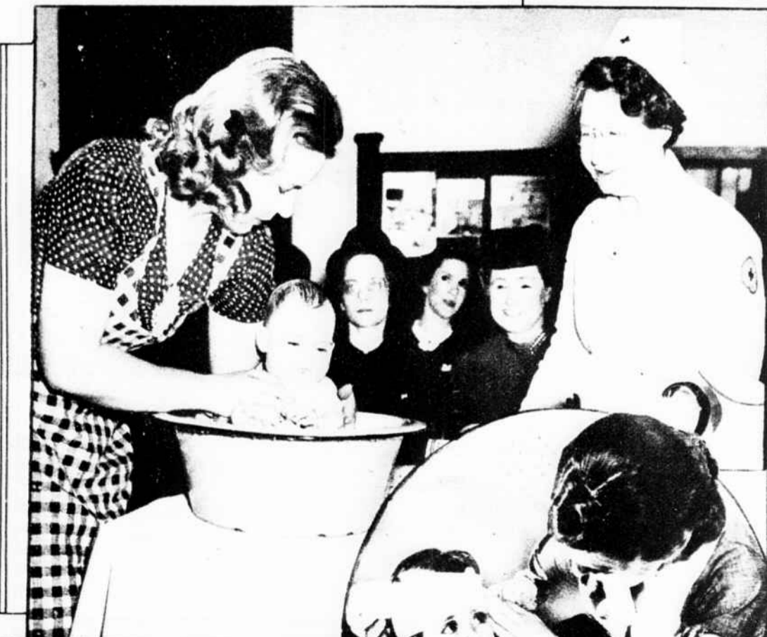
Valuable training in home nursing given by Red Cross aids health of the family