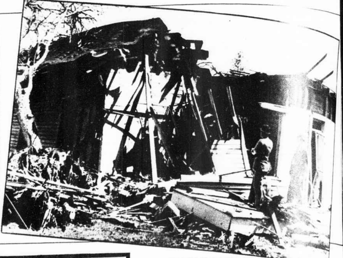
Havoc of a tornado to be restored by Red Cross