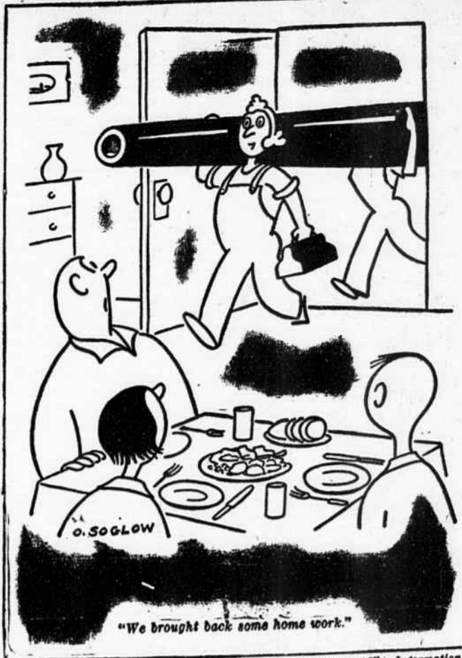
7-2,00-1013 Drawn for the Office of War Information

(Continued From Page One) S. Army after serving for some