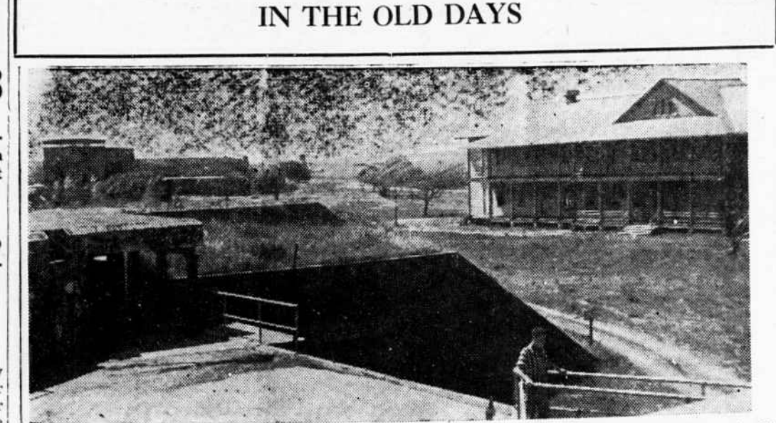
TOURIST .--- In the foreground is a visitor looking over the deserted buildings of old Fort Caswell priod to the time that it was converted into a year-round resort.