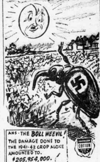
ANS—THE BOLL WEEVIL! THE DAMAGE DONE TO THE 1941-42 CROP ALONE AMOUNTED TO $205,954,000.

WHAT INSECT IS THE SOUTH'S MOST VICIOUS SABOTEUR?