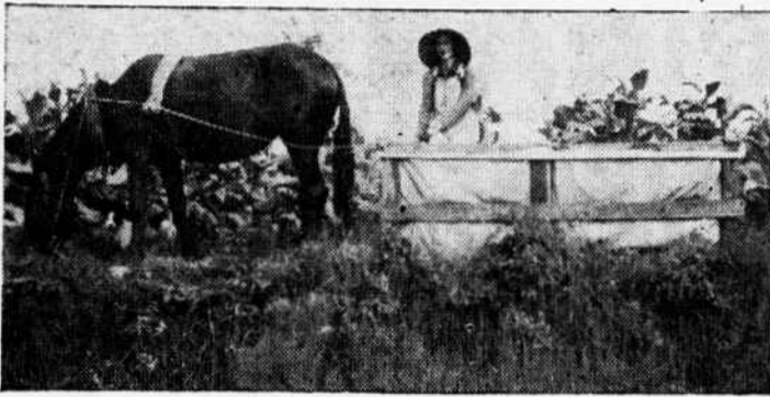
CROPPING.—Scenes similar to the one above are general throughout the county now as Brunswick county tobacco farmers harvest their 1943 crop. Some farmers have already put in tobacco as many as three times.