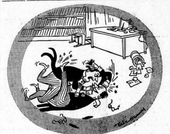
"Now—will you give back the Pepsi 'Treasure Top' you borrowed from me, A. J.!"

"We regret exceedingly the attempt to inject influence which might overlook the basic principle of supply and demand, on which the quota system,