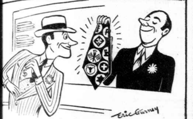
"This is very smart—they got the idea from hidden designs you'll find under Pepsi-Cola bottle tops."