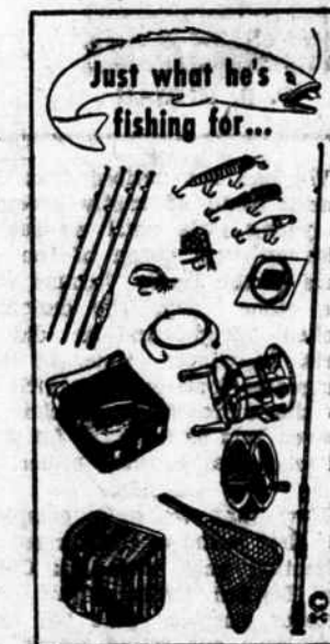
Just what he's fishing for...