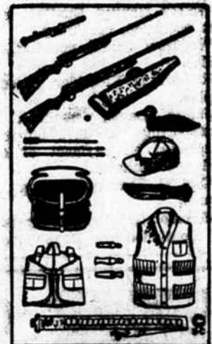
Knives, Lights, Base Ball Goods, Sporting Goods, Gifts for Fishermen.