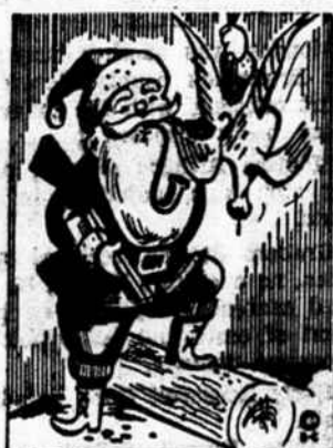
Guns, Rifles, Air-Rifles, Ammunition.

— Member Federal Deposit Insurance Corporation —