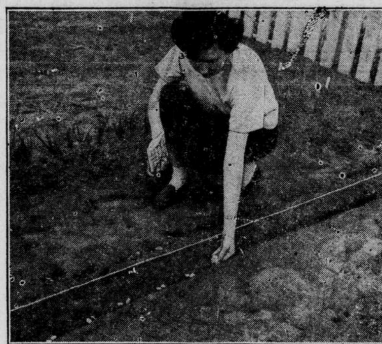
Beans Can Be Sown in Pairs, Properly Spaced, to Insure a Good Stand.