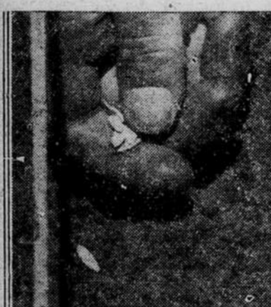
Let Seed Drop From the Fingers, Evenly Spaced.

Bush beans usually are allowed to grow four inches apart in the row. If you wish to avoid vacant