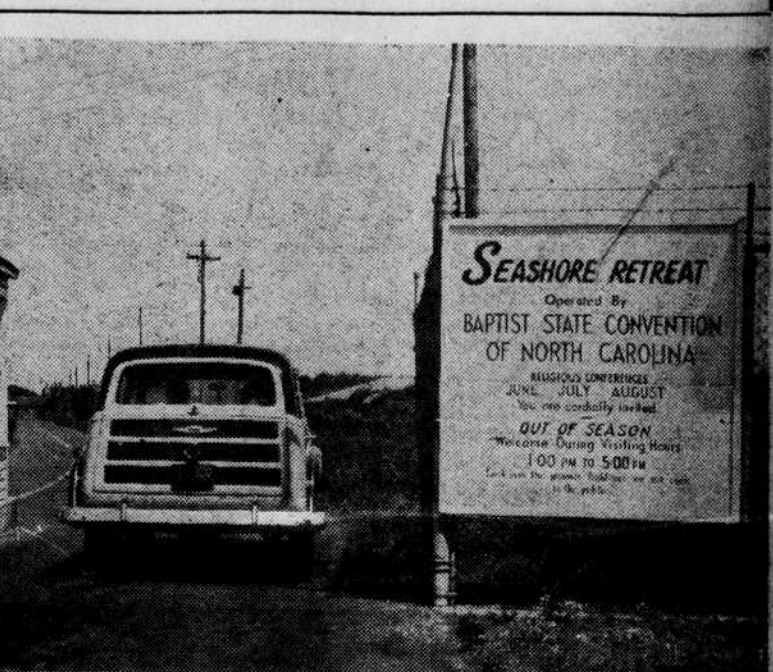
PREPARATIONS—Everything is being placed in readiness for the opening of the first week of the summer session of the Baptist Seaside Assembly at Ft. Caswell. This will mark the first season in the new location, purchased last year by the Baptists of North Carolina from the War Assets Administration.