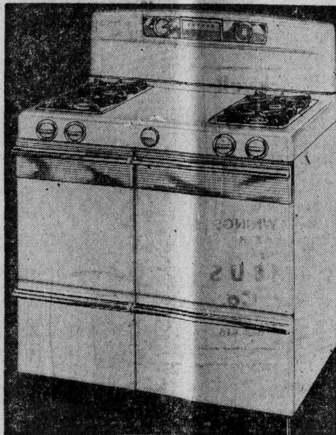
MODEL PRT 772

This beautiful Tappan range is built to CP (certified performance) Standards in every way. Matchless is the word as every burner lights automatically and cooking on a gas range cannot be matched by any other method—every burner guaranteed for life —Fast & Flexible—Save those vitamins—Easy to clean—Dependable