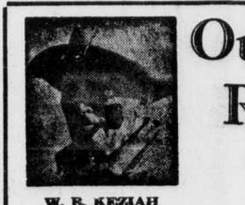
W. B. KEZIAH

The band parade, etc., and (Continued On Page Two)