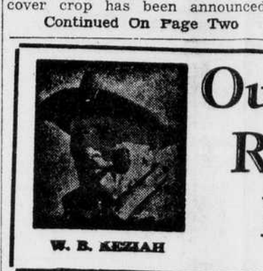
W. B. KEZIAH

Another change in the winter cover crop has been announced. Continued On Page Two