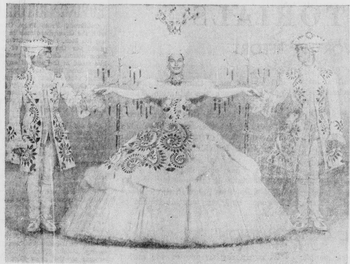
"FANTASY IN PINK" will be one of the 10 productions and 20 acts of "Ice Capades of 1956" when the big ice spectacle is staged in the William Neal Reynolds Coliseum at North Carolina State College October 31-November 5. Pictured here is a scene from the fantasy number.