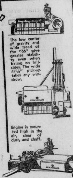
The low center of gravity and wide tread of the "66" give greater stability even when baling on hill-sides. The wide 47 1/2" pick-up takes any wind-draw.