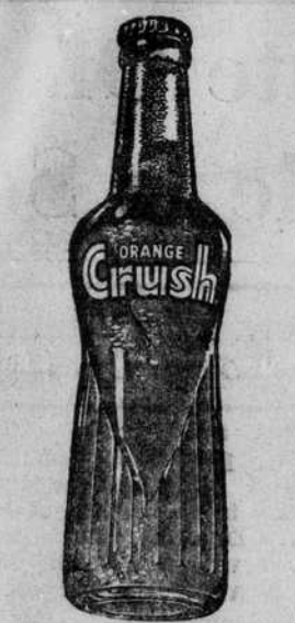
Electric Bottling Co., Inc. WILMINGTON, N. C.